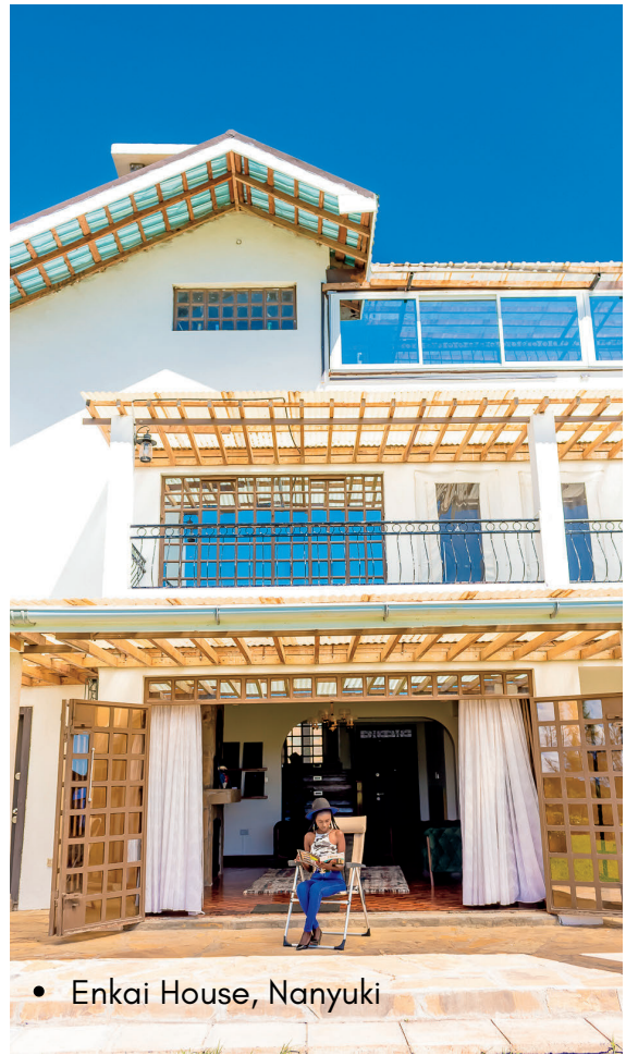
• Enkai House, Nanyuki